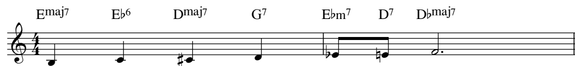
Figure 17. Strayhorn, B. Last two bars of Lush Life

Similarly, in the final phrase of Lush Life the chords descend chromatically, first from E maj7 to D maj7 , then from E b m 7 to D b m aj7 , while the melodic line ascends chromatically from B to F.